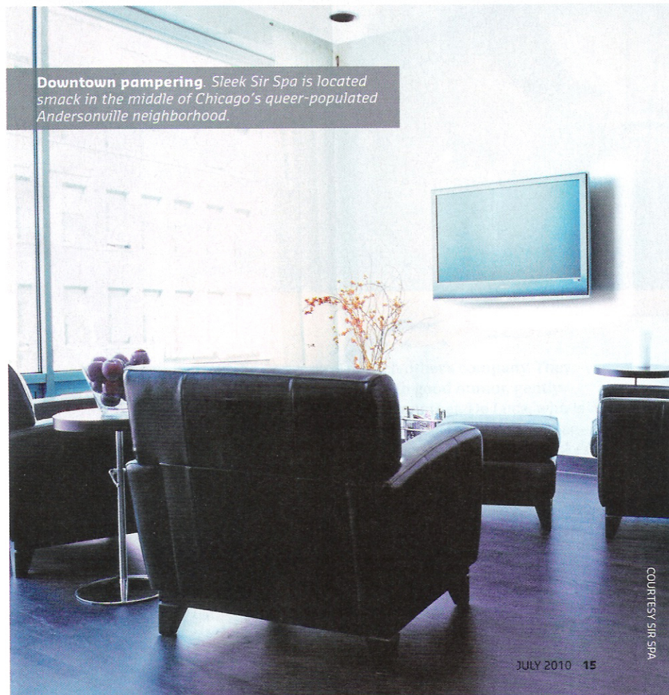
Downtown pampering. Sleek Sir Spa is located smack in the middle of Chicago's queer-populated Andersonville neighborhood.