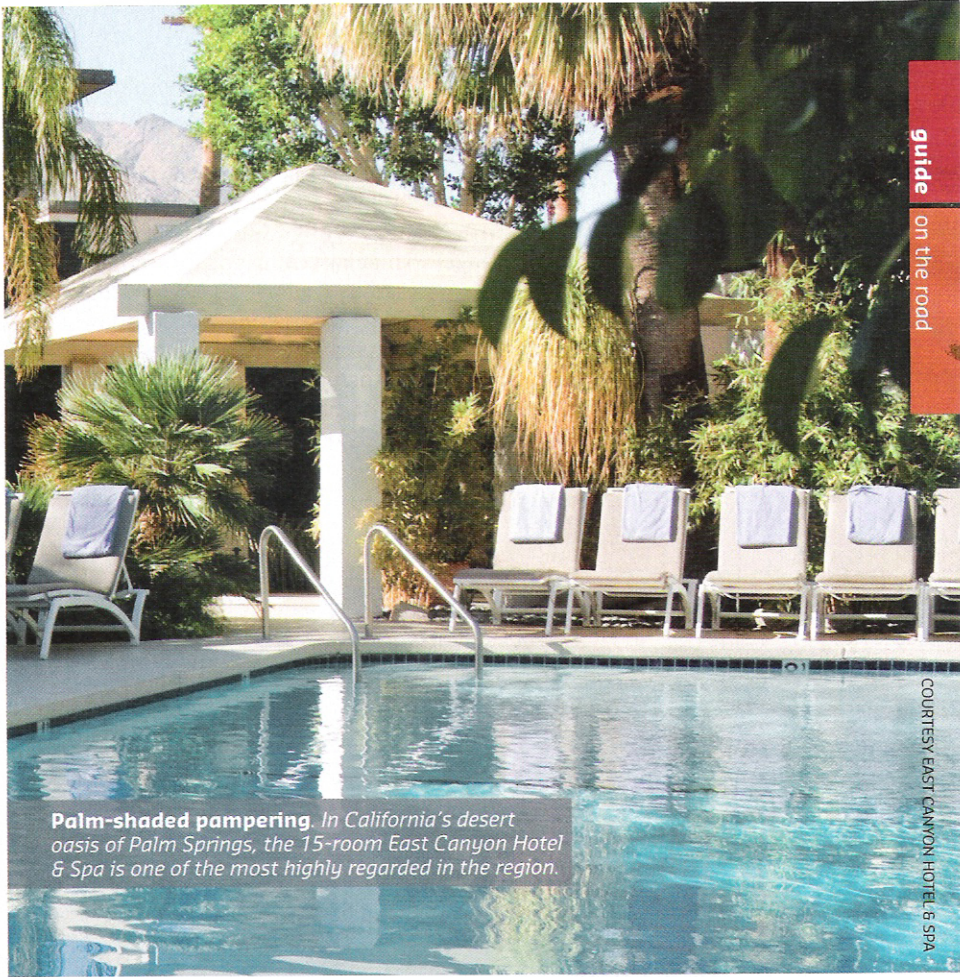
Palm-shaded pampering. In California's desert oasis of Palm Springs, the 15-room East Canyon Hotel & Spa is one of the most highly regarded in the region.